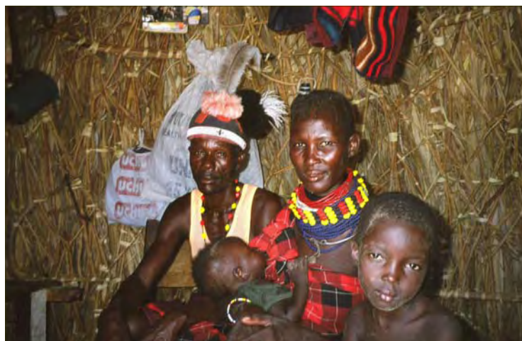
Above: Turkana Family in their humble home. Below: View of a Turkana village in Lodwar, Kenya. Kakuma Refugee Camp is in Turkana territory.