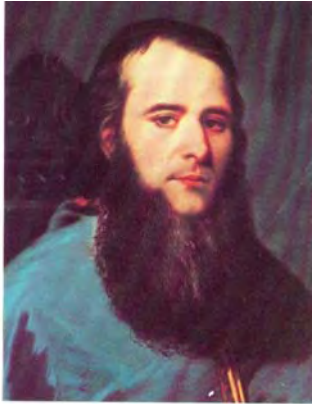
Left: Portrait of Monsignor Melchior de Marion Bresillac, Founder of the Society of African Missions (S.M.A.).

This year, 2009, marks the 150th Anniversary of the death of the Founder of the Society of African Missions. His zeal and wholehearted sacrifice inspires courage and faith. “Unless the grain of wheat falls into the ground, it remains but a grain of wheat, but if it falls and dies, then it bears much fruit. . . .”