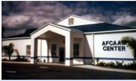
Below: The AFCAAM Center in Florida

"Such gold the holy martyr Lawrence (The Deacon) preserved for the Lord. For when the treasures of the Church were demanded from him, he promised that he would show them. On the following day he brought the poor together. When asked where the treasures were . . . he pointed to the poor saying: 'These are the treasures of the Church.'" — St. Ambrose