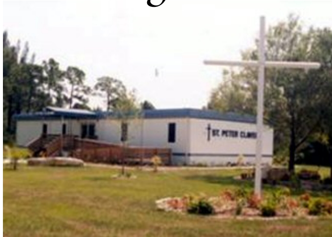
Above: St. Peter Claver Mission Church in Fort Myers, Florida serves a very diverse community.